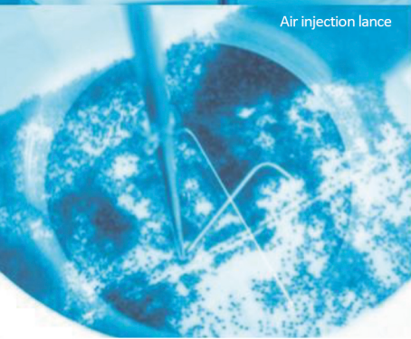
Air injection lance